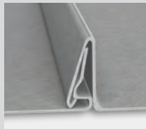
SLZ-1000 AFTER LOCKING